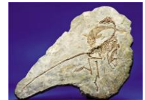
Marine & land creatures buried together

Why were the evidences you chose the most convincing?