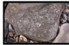
Marine fossils on mountaintops