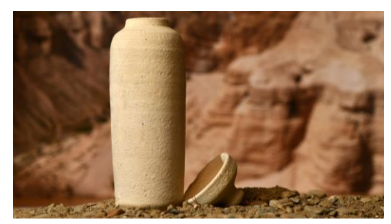
The Dead Sea Scrolls were found in caves stored in jars like the one shown above.

In 1947 shepherds chasing a lost sheep in the caves above the Qumran Valley northwest of the Dead Sea made one of the most significant archaeological discoveries of our time—the Dead Sea Scrolls. The scrolls were found in numerous clay jars and included fragments of almost every book in the Old