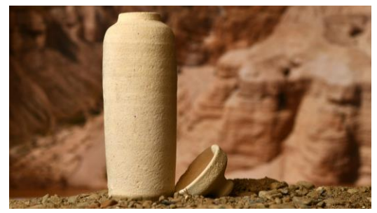
The Dead Sea Scrolls were found in caves stored in jars like the one shown above.

In 1947, some shepherds looking for their lost sheep near the Dead Sea found some caves. They wondered if their sheep had wandered into a cave. Since they knew that wild animals sometimes live in caves, one of the shepherds threw a rock into the cave to make sure it was safe to go in. Instead of a roar, they heard a loud crash!