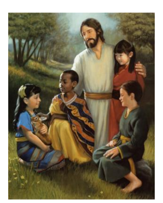
You are a child of God!

5. God created us. You are a child of God!