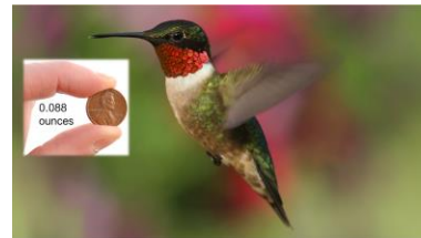
Ruby Throat Hummingbird