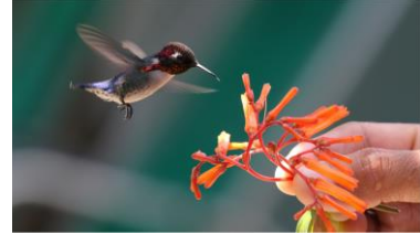
Cuba Bee Hummingbird