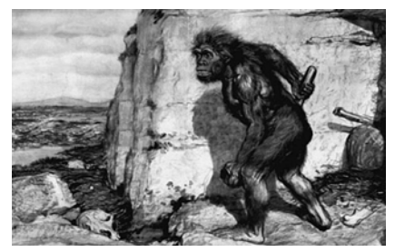
This picture of a Neanderthal appeared in the Illustrated London News in February of 1909.

Recently, there has been overwhelming evidence that Neanderthals were actually human. How do you think the public was biased when they saw the above illustration? It demonstrates how evolutionists sometimes make an effort to portray human fossils as being ape-like, and ape fossils as being human-like.