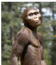
Australopithecus afarensis (Lucy)