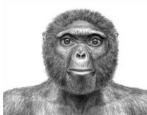
Ardipithecus ramidus (ARDI)